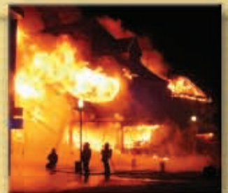
FIRE & ENVIRONMENTAL DAMAGE